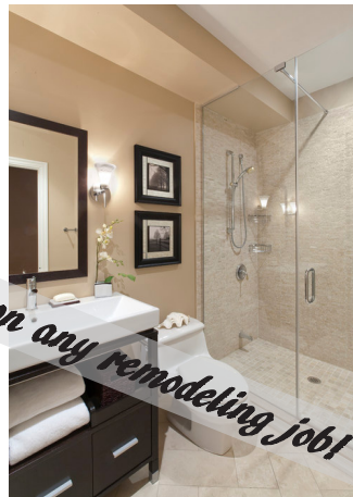
Painting & Services Unlimited Lic. CC94BS00437 • Lasora Enterprises, Inc CGC031497 Licensed & Insured General Contractor