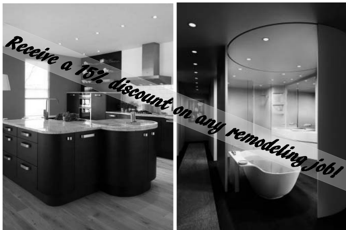
Painting & Services Unlimited Lic. CC94BS00437 • Lasorsa Enterprises, Inc CGC031497 Licensed & Insured General Contractor

Valid With Coupon. Not To Be Combined With Other Offers. Exp 8/31/2012